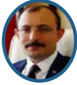
Dr. Mehmet Muş Minister of Trade