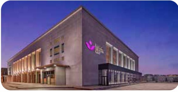
Istanbul Lutfi Kirdar International Convention And Exhibition Centre