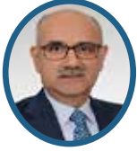
Prof. Dr. Vahit Kirişçi Minister of Agriculture and Forestry