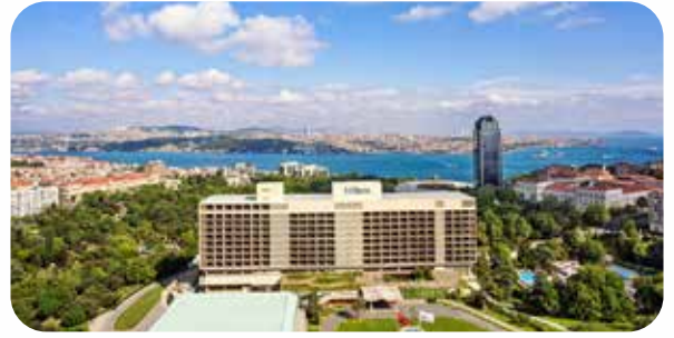
Hilton Istanbul Bosphorus