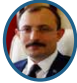
Dr. Mehmet Muş Minister of Trade