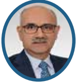
Prof. Dr. Vahit Kirişci Minister of Agriculture and Forestry