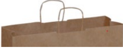
Figure I-2 Twisted paper bag handles