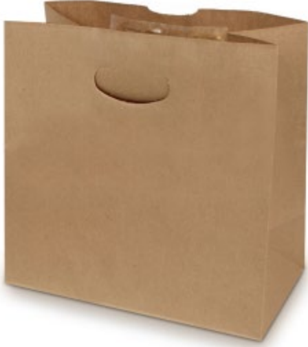
Figure I-5 Bag with die-cut handle

Source: Novolex DURO® ¾ Die Cut Handle Bags, http://novolex.com/assets/content/D_BR_0212_0417_Duro_3_4_DieCutHandleBags_Brochure.pdf , retrieved June 13, 2023.