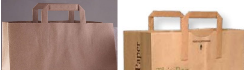
Figure I-3 Flat paper handles 27