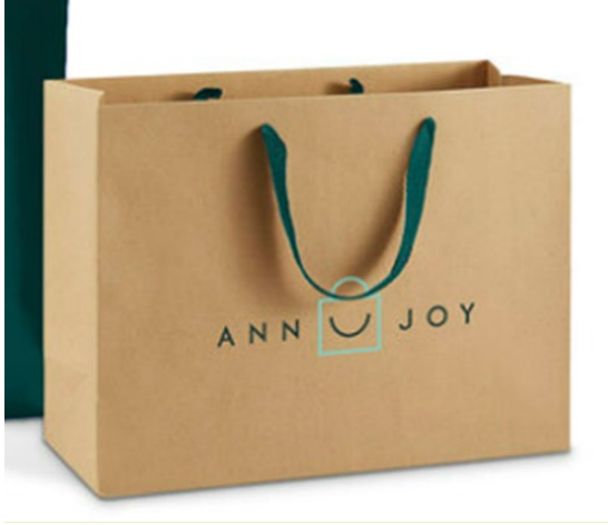
Figure I-4 Paper bag with paper ribbon handle