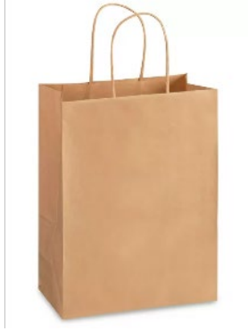
Figure I-1 Kraft paper shopping bag